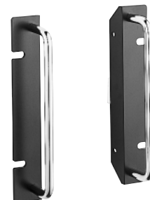
SA-K67U D-9 Series Rack Mount