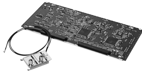
SA-D50U Serial Digital Interface